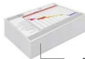
7,700 Sheets on-line