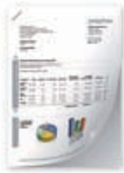
Stapling and Hole Punching