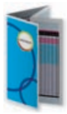
Double parallel Fold