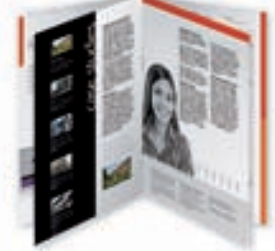
Saddle Stitching and Trimming